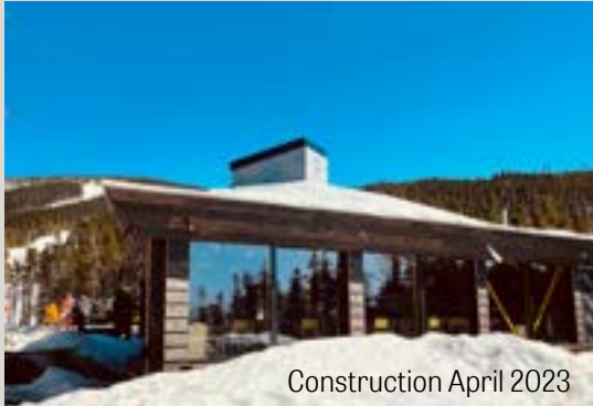
Construction April 2023