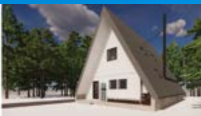
Parmachenee A-Frame Development Site Summer 2022.